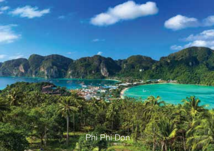
Phi Phi Don