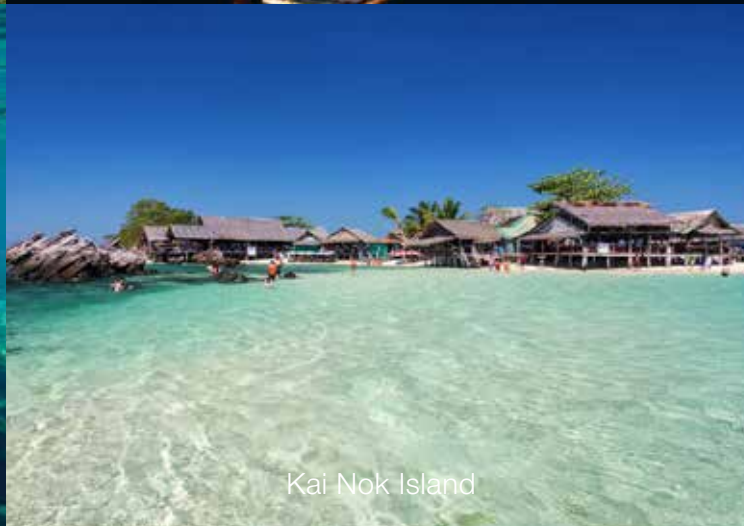
Kai Nok Island