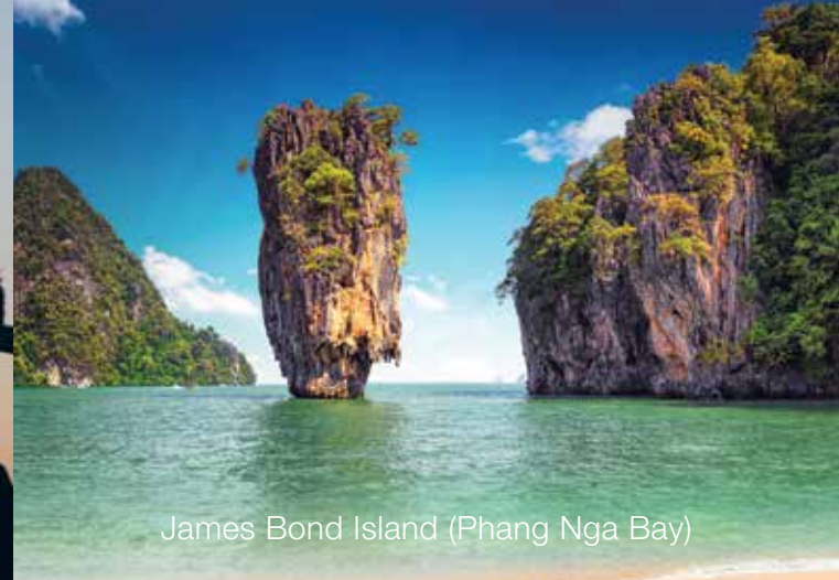
James Bond Island (Phang Nga Bay)