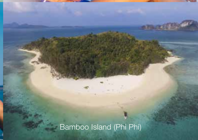
Bamboo Island (Phi Phi)